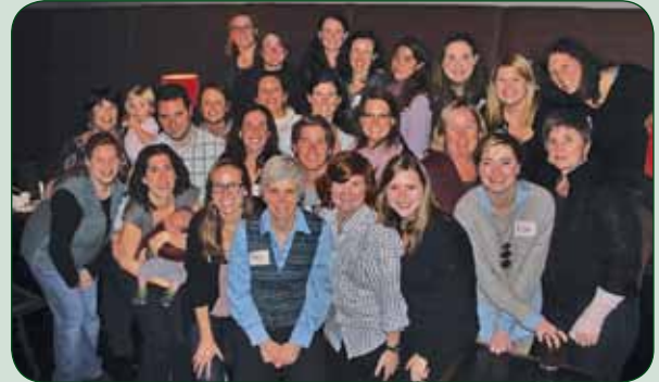
Boston Alumni Reunion - November 2011